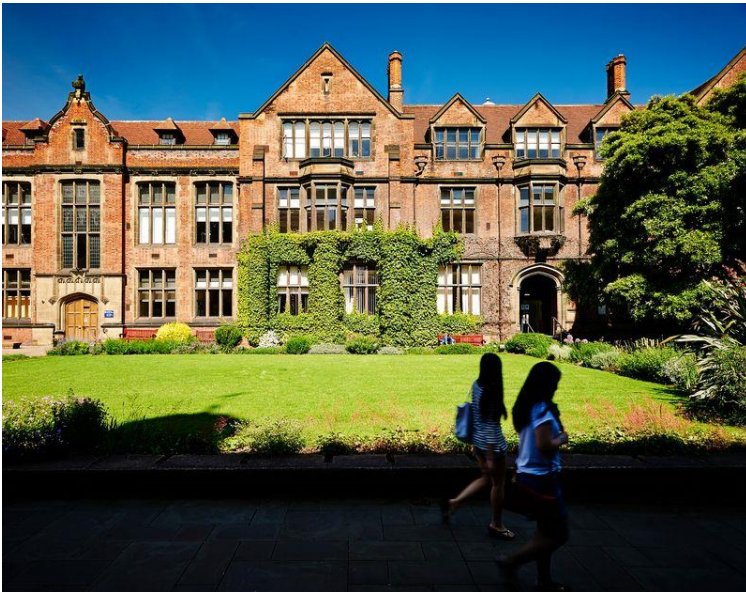
Architecture Building © John Donoghue

Power, place and materiality uses cultural and social analysis in research on the built environment which investigates the meanings of place, the production of space, and the power relations between different people and institutions involved. Research and publication incorporates issues such as sustainability in historic urban cores, health, obesity and the built environment, and mobility in later life.