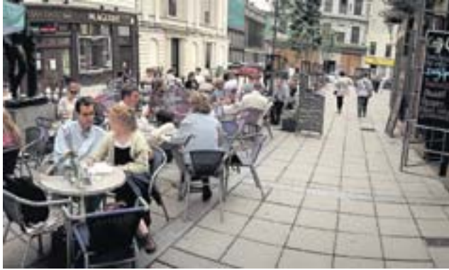
Merchant City, Glasgow