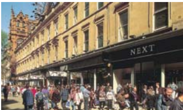
Buchanan Street, Glasgow