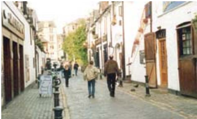
Ashton Lane, Glasgow