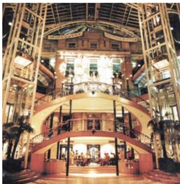
Princes Square, Glasgow

Mix of plenary and parallel workshop sessions