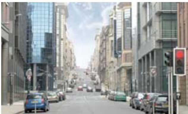
West Campbell Street, Glasgow